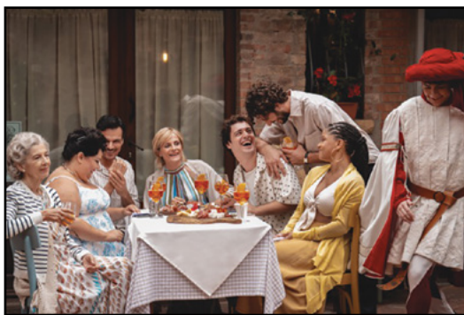
The cast of You, Me & Tuscany