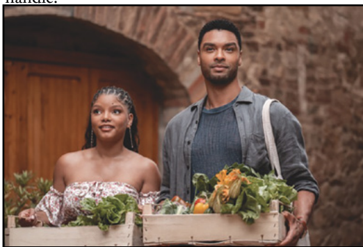
Halle Bailey and Regé-Jean Page in You, Me & Tuscany