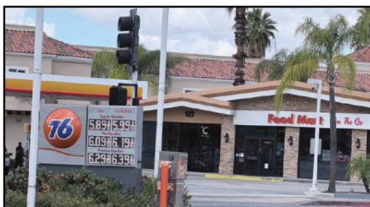
Shell gas station in Redlands, San Bernardino County, California, on April 11, 2026.

California drivers are once again paying the highest prices at the pump in the nation, setting off a renewed clash between Democrats and Republicans over who is responsible — and what should be done.