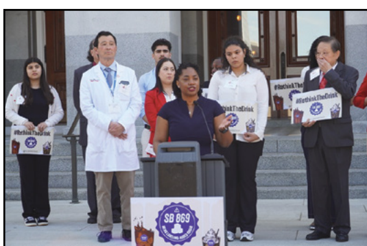
Sen. Akilah Weber Pierson’s bill, SB 869, would require chain restaurants to label beverages containing high levels of added sugar — defined as 50% or more of the recommended daily amount — on their menus. If passed, chain restaurants with 20 or more locations would be required to place a warning icon on menus beginning Jan. 1, 2028.

On April 9, the bill passed out of the Senate Health Committee with a 9-0 vote and was referred to the Senate Appropriations Committee.