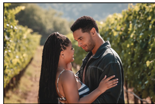
Halle Bailey and Regé-Jean Page in You, Me & Tuscany