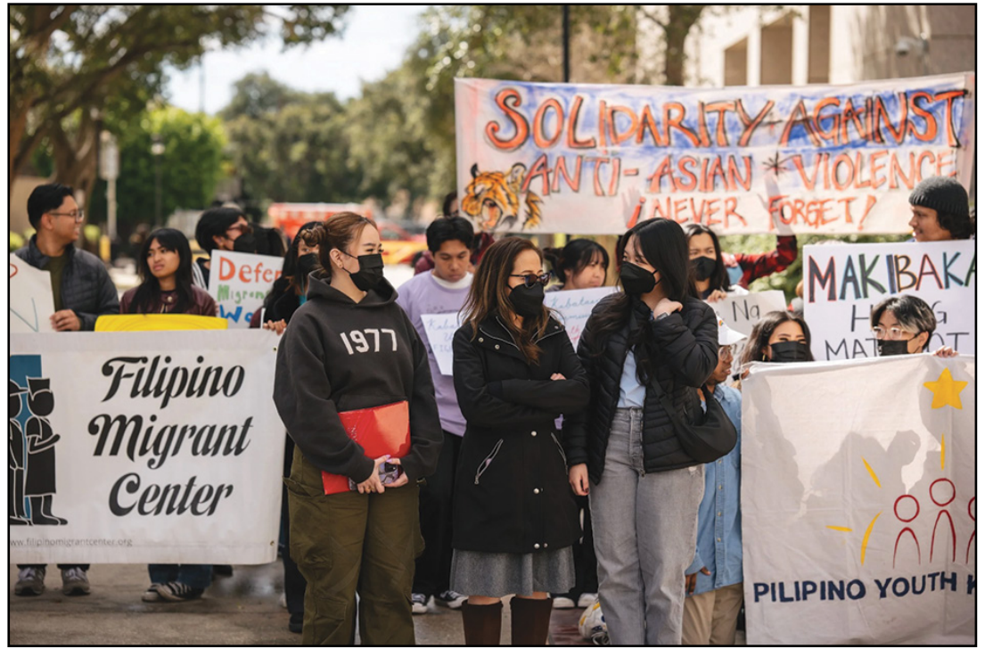
Filipino Migrant Center stands in solidarity against Anti-Asian Violence

This story was produced in partnership with CA vs Hate. Join them for the first-ever CA Civil Rights Summit on May 11, 2026. More information at www.cavshate.org/summit