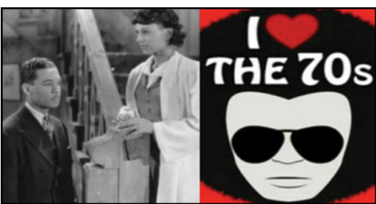
Race Films and 1970s Black Cinema DVD sets

of 1970s African-American cinema, featuring 100 Black-themed movies from that decade.