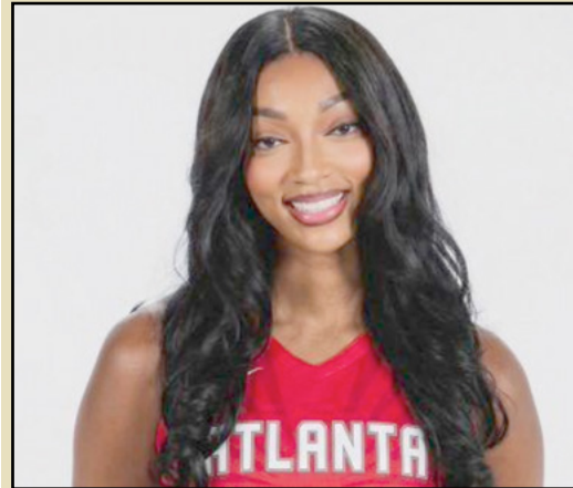
Angel Reese Atlanta Dream

And if you're tired of seeing the same people doing everything, step up. I will help you. If you're not at the table, you're on the menu. Somebody has to get it done. Why not you?