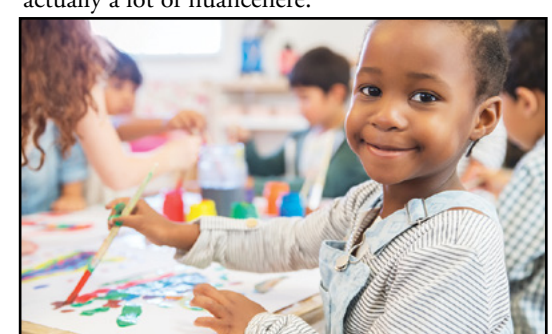
Student painting in class