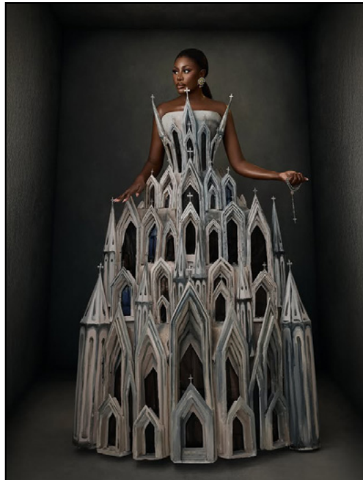
Ghanian actress Nana Akua Addo wearing a Cathedral dress inspired by the Cologne Cathedral, Germany. Costume by @abasswoman.ng nanaakuaaddo

Of Osas Ighodaro's metal sponge ballgown by Veekee James, she said: "Using metal sponges and turning them into something that still looked elegant and red-carpet worthy was very creative."