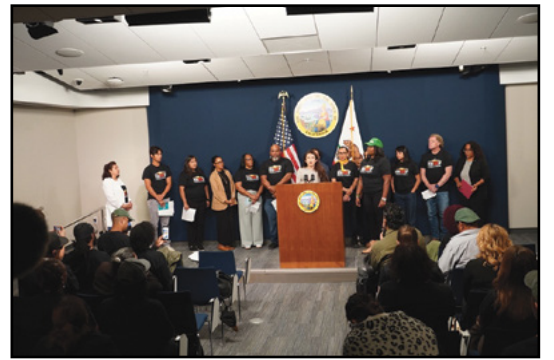
Survivors of the Eaton Fire from Altadena and Pasadena traveled to Sacramento and held a rally and press conference at the State Capitol Swing Space Annex on May 19. They voiced frustration over delays in rebuilding, inadequate insurance payouts, and concerns about displacement from their communities.