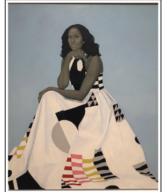
Michelle LaVaughn Robison Obama, 2018 Oil on Linen.