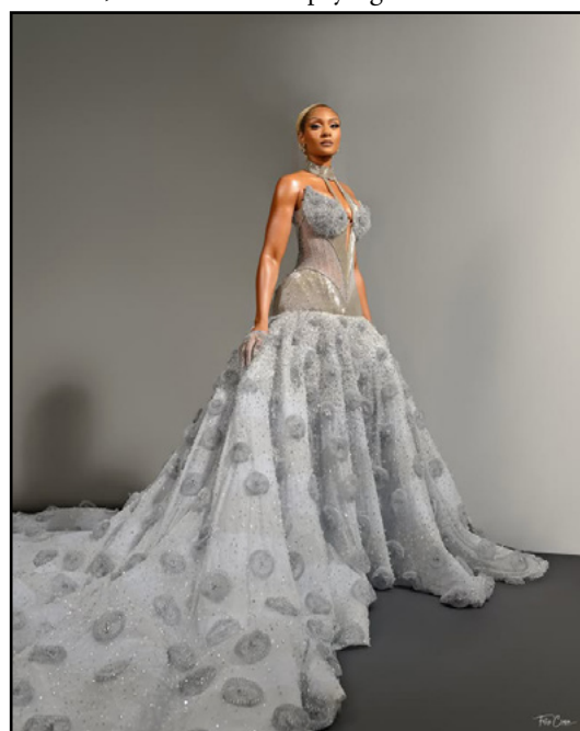
Reality star, Mercy Eke dressed in a beaded dress and hair gear inspired by the royalty and heritage of the Edo culture. Stylist: @styled_by_maklinscout