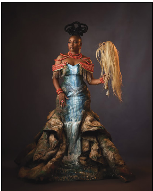
Actress, Bisola Aiyecola, dressed in a waterfall outfit titled "Mmiri Ndu (Water Of Life)" designed by @kgz_opulence

For Perpetua, 2026 marks a turning point that has been building for years: "African designers are no longer trying to catch up. We're creating our own lane now, and the world is paying attention."