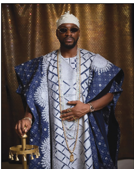
Actor Tobi Bakre wearing an 8kg custom-designed 'Agbada ileke' inspired by traditional rulers & elites of Yoruba heritage in the late 1956-1958s, period, mixed with influences from Hausa-Fulani culture. Styled with beads and chains associated with Yoruba royalty. Outfit created by: @dejiandkola

What the Looks Were Actually Saying Actress Bisola Aiyecola's gown, titled "Mmiri