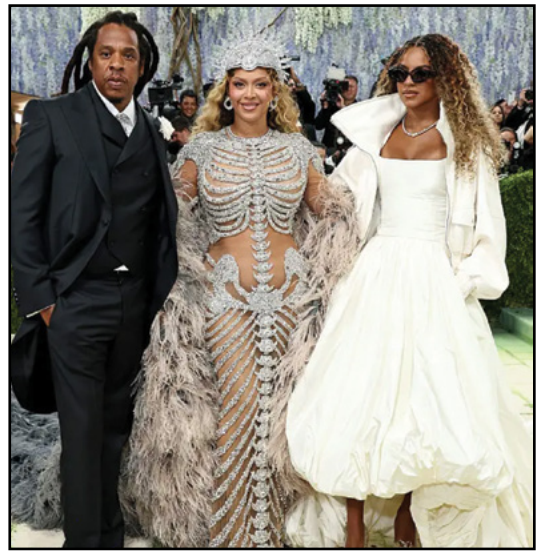
partner ASAP Rocky.

“I feel like a pearl out of an oyster,” Rihanna said to reporters on the carpet.