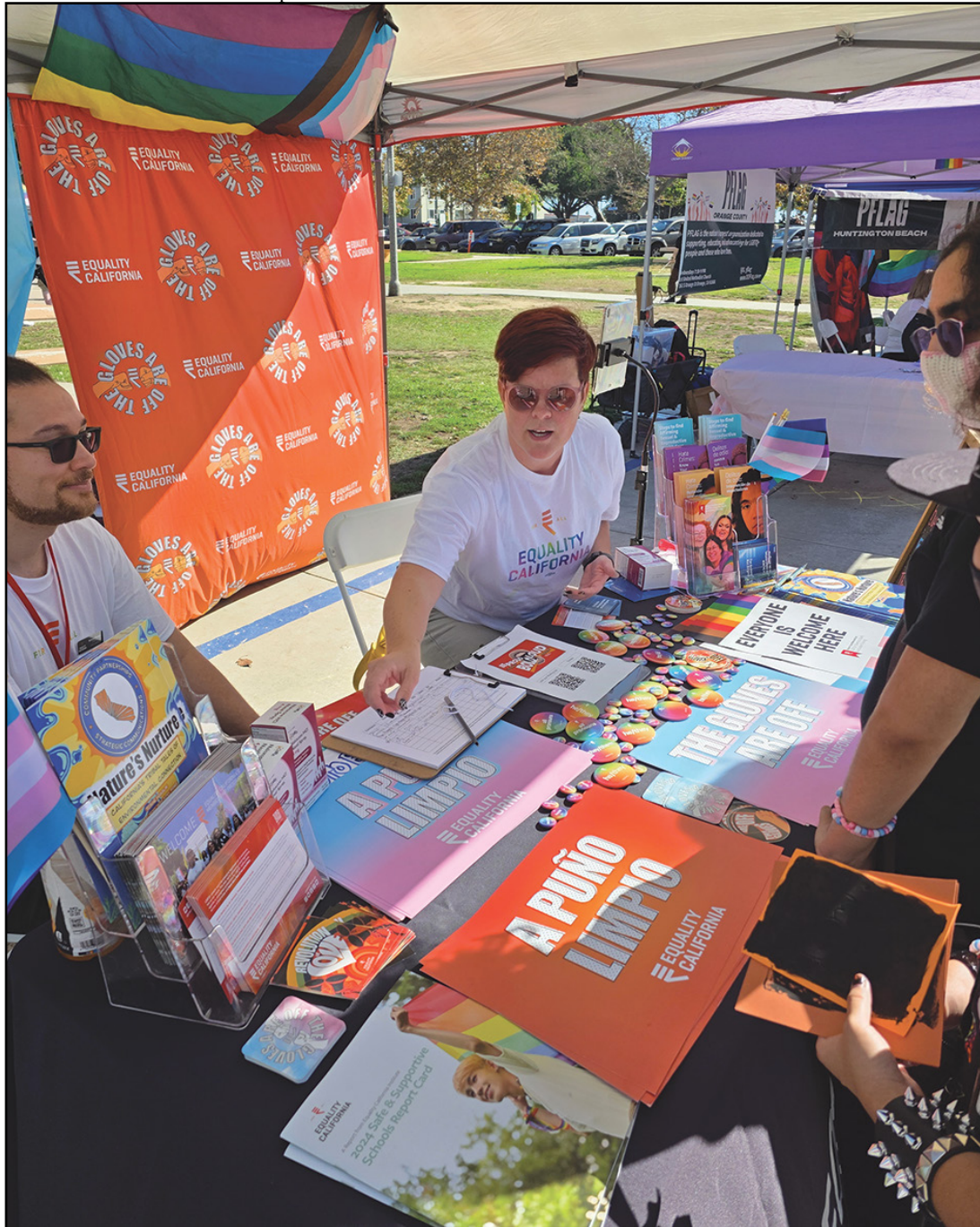
EQCA multi-lingual public outreach and education efforts are critical to advancing social justice and creating safer communities for LGBTQ people.

can turn to, and thousands of people have already reached out. From mental health counseling to legal assistance, the hotline is a nation-leading example of how we can drive real impact when we work together with our local partners.”