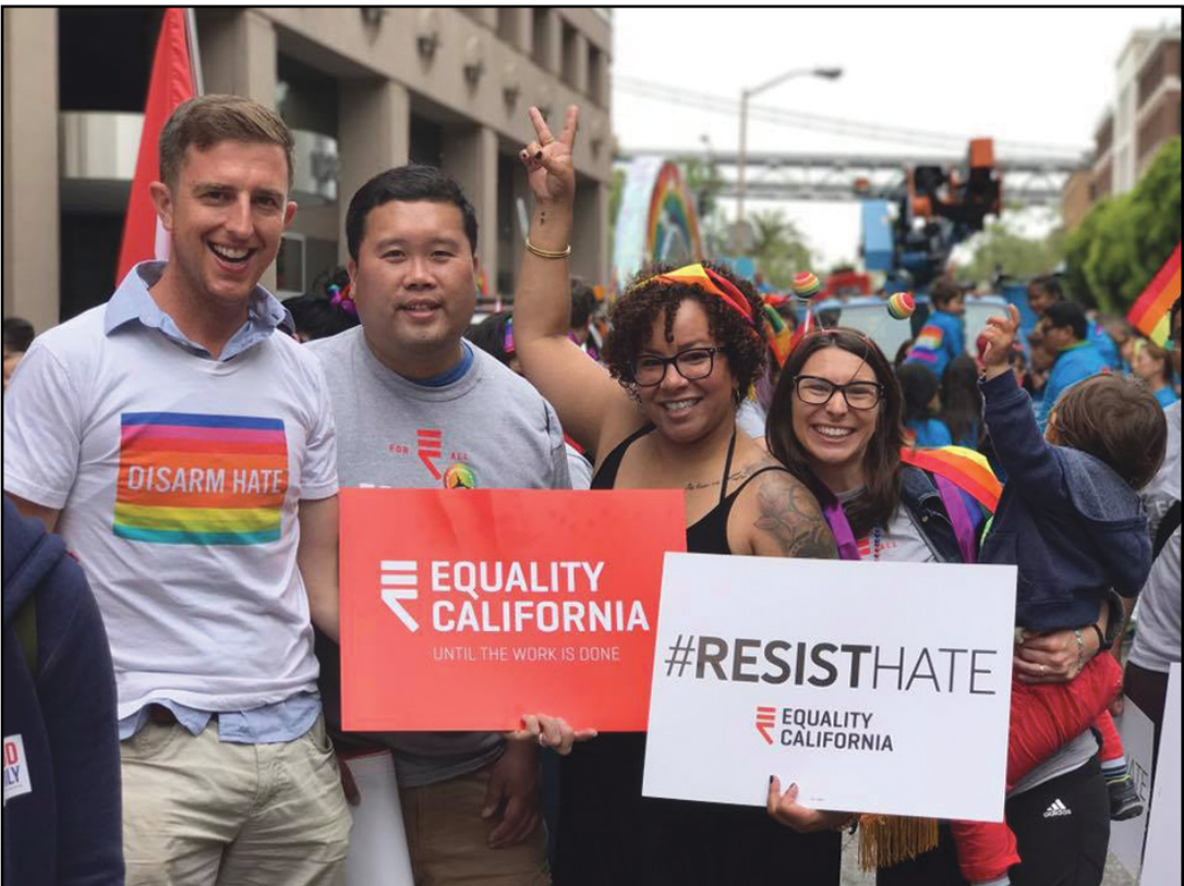
Equality California works to advance civil rights and social justice by inspiring, advocating, and mobilizing through an inclusive movement.

State Controller’s Office, Unclaimed Property Division P.O. Box 942850, Sacramento, CA 94250-5873 California Relay (telephone) Service for the deaf or hearing impaired from TDD phones: 1-800-735-2929 and ask for 1-800-992-4647