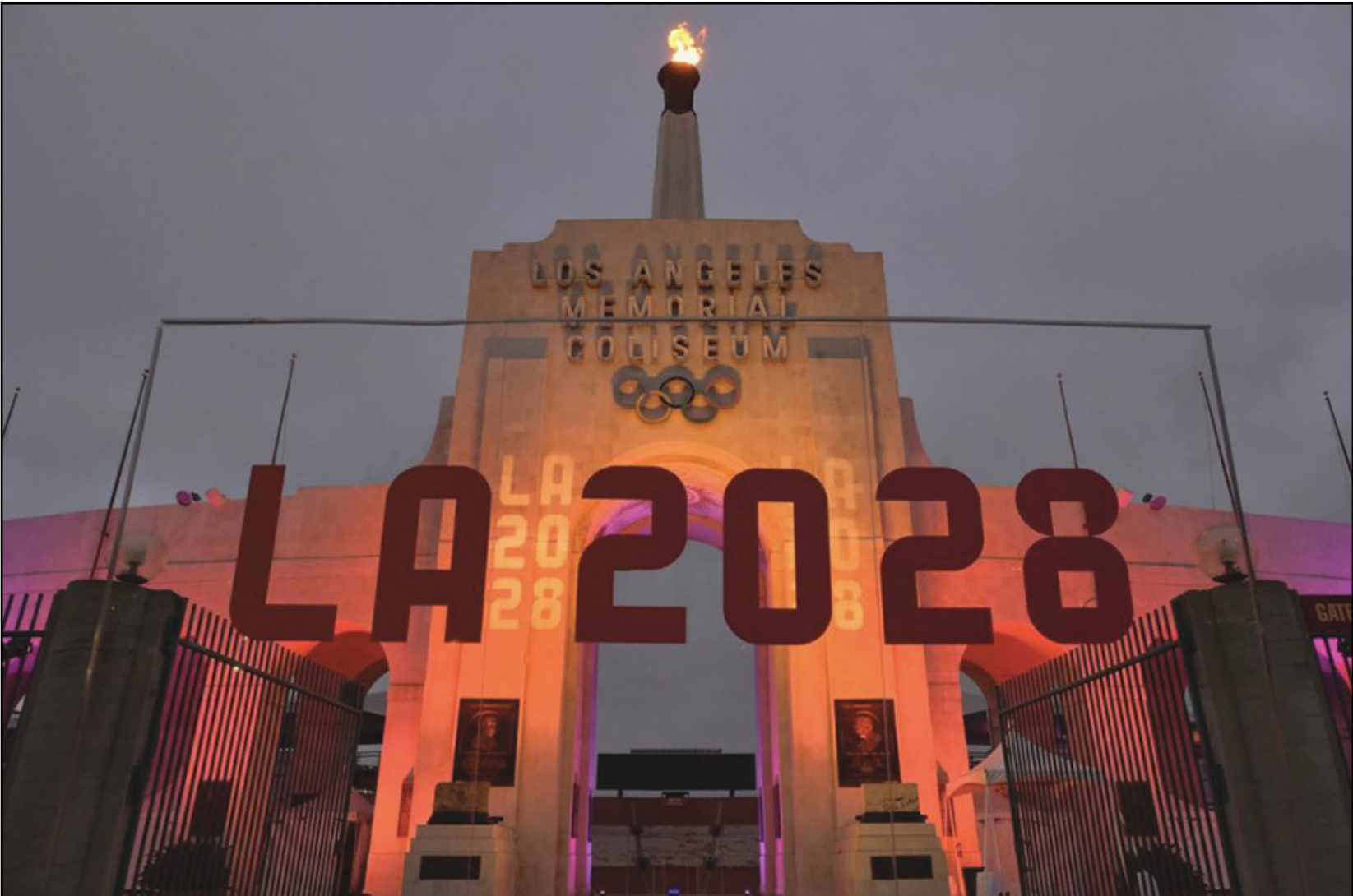
An LA2028 sign in front of a blazing Olympic cauldron at the Los Angeles Memorial Coliseum on Wednesday, Sept. 13, 2017. The cauldron was lit early Wednesday morning at the stadium that was the site of the 1932 and 1984 Olympics.

Via The Los Angeles Sentinel Tickets for the 2028 Olympic Games go on sale in August, but fans must register by July 22 to enter a random draw for access to purchase them. Selected participants will receive an email with a designated time slot to access the ticket sale when it opens in August. The upcoming sale is the second ticket release, following an initial presale that ran April 2-6 for residents in the Greater Los Angeles area, with tickets then opening to the global market from April 9-16. "The response to our initial on sale was nothing