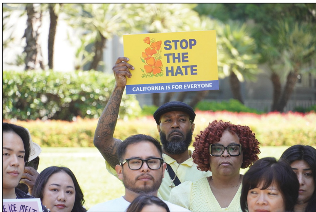
Sacramento - Black Orgs Stand with Other Groups to Request Extension of Stop the Hate Funding

By Antonio Ray Harvey California Black Media