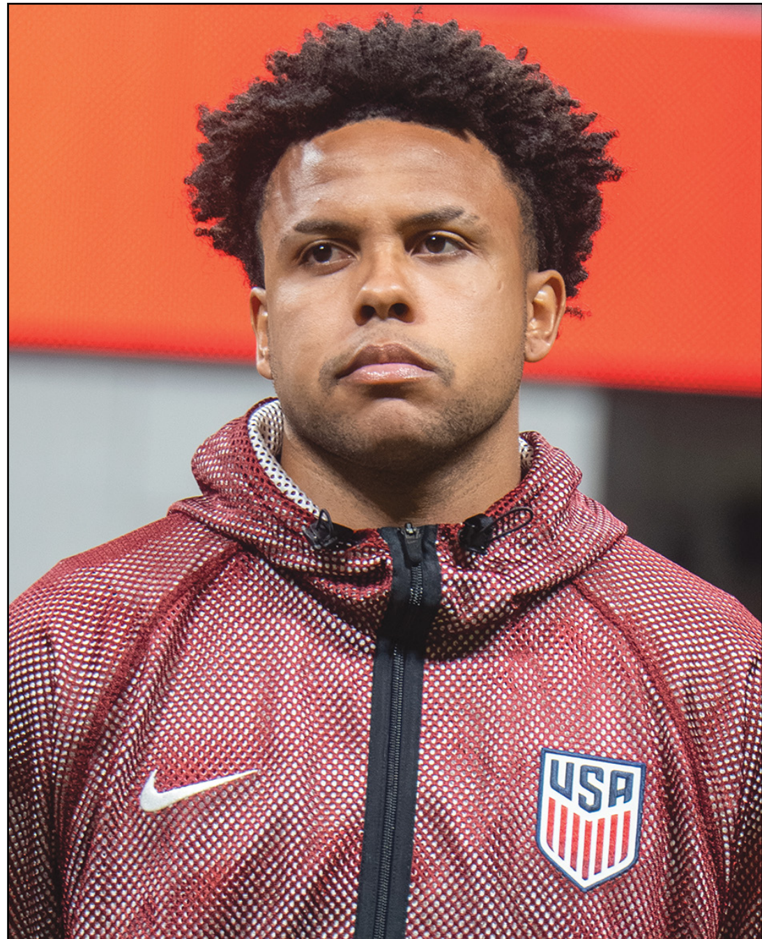
Weston James Earl McKennie - Team USA

As the countdown continues, Los Angeles is preparing to take its place on one of sports' biggest stages. With matches, fan events and visitors from across the globe, the FIFA World Cup 26™ will offer Southern California a rare opportunity to celebrate soccer, culture and community before an international audience.