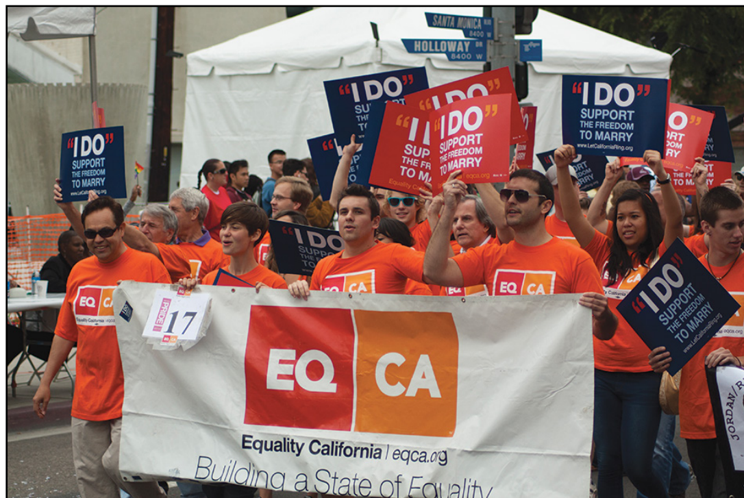
EQCA at the Los Angeles LGBT pride parade in 2011.

“Everyone deserves support after experiencing hate,” said Business, Consumer Services, and