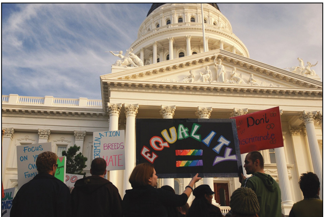
Californians protesting Prop 8, a 2008 ballot measure that would ban same-sex marriages in the state. EQCA would be instrumental in passing Proposition 3 in 2024, which would ensure same-sex couples retained the right to marry.