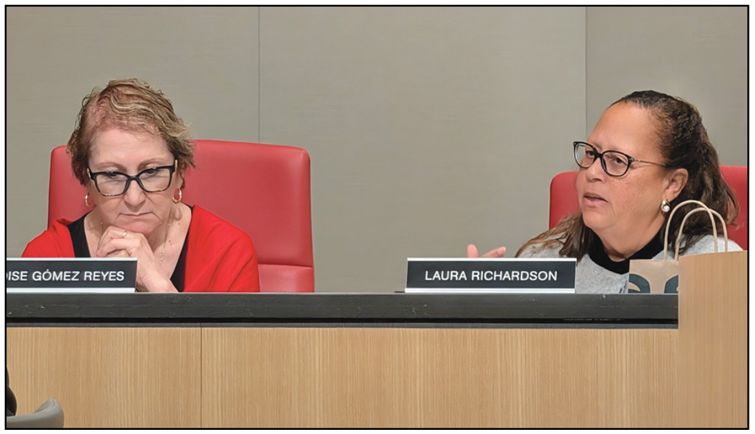
On May 5, Sens. Laura Richardson (D-San Pedro), right, and Eloise Gómez Reyes (D-Grand Terrace), members of the Senate Standing Committee on Budget and Fiscal Review, voted to advance AB 108, a measure that would provide $25 million in emergency assistance to financially distressed public hospitals. The bill passed out of committee on an 18-0 vote, but public hospital advocates are seeking $500 million in the governor's proposed 2026-27 state budget to offset federal budget cuts.