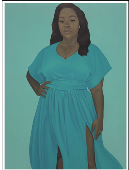
Breonna Taylor, 2020, Oil on Linen, by Amy Sherald.