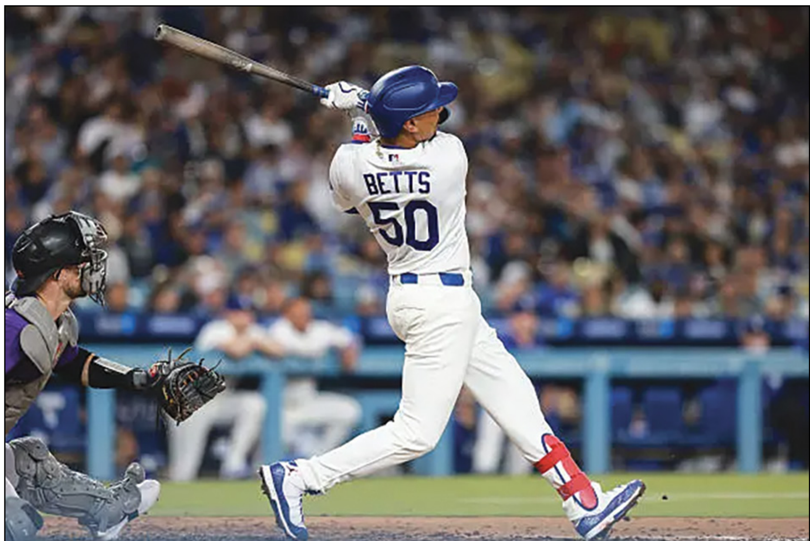
Mookie Betts #50 of the Los Angeles Dodgers hits a home run during the game between the Colorado Rockies and the Los Angeles Dodgers at UNIQLO Field at Dodger Stadium on