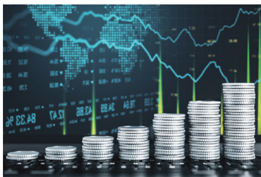
strategies to build equity and create additional income streams: Purchasing starter homes

Starting earlier allows investments more time to potentially grow, making consistency an important priority for many investors. Even if you are in your teens or twenties right now, start investing. Putting $5 or $20 into an ETF starting in your teens or twenties could result in millions by the time you are ready to retire in your 50s or 60s. Don't lose out on the power of time to make smaller amounts of money into huge piles of retirement dough. Real Estate Homeownership continues to be viewed as both a personal milestone and a financial investment opportunity. Some younger Black investors are exploring different