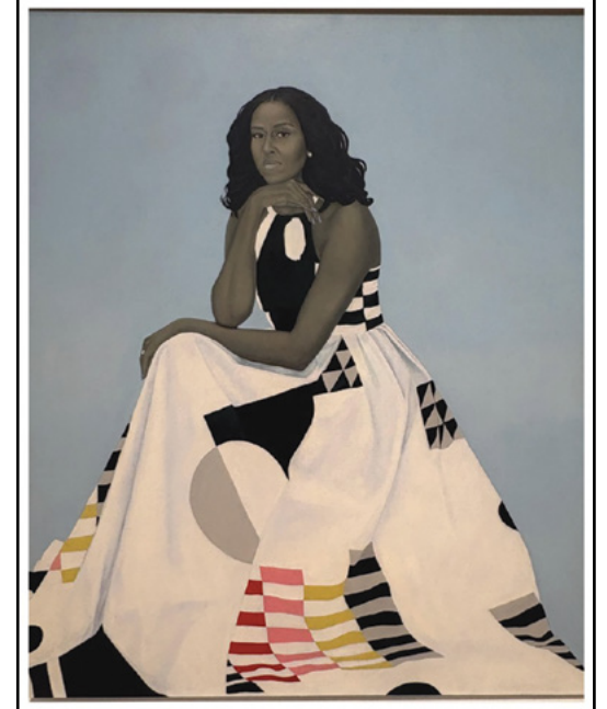
Michelle LaVaughn Robinson Obama, 2018 Oil on Linen.