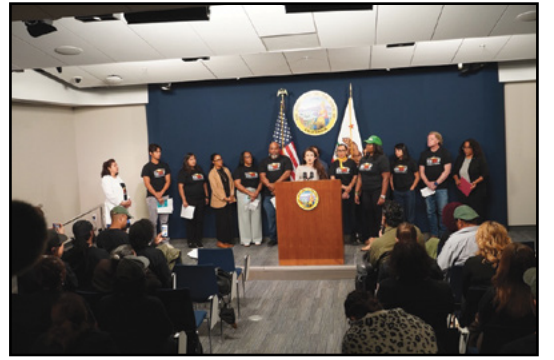
Survivors of the Eaton Fire from Altadena and Pasadena traveled to Sacramento and held a rally and press conference at the State Capitol Swing Space Annex on May 19. They voiced frustration over delays in rebuilding, inadequate insurance payouts, and concerns about displacement from their communities.