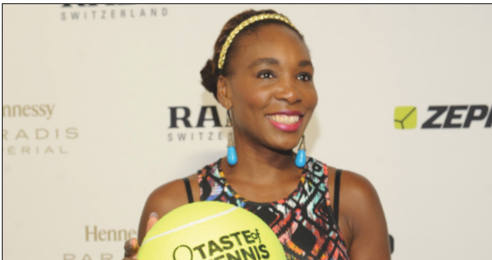
Venus Williams at Taste of Tennis New York 2015.

Williams reacted with understanding. She admitted the moment made her sad and said she had been swept up in Sabalenka's emotions, feeling a surge of empathy for her. She praised the Belarusian for laying everything bare on court, where every feeling shows. Crucially, Williams did not read the comment as a real farewell. She said she did not believe Sabalenka truly wanted to leave, calling such an outcome a loss for both the player and the sport. Rather than scold her, Williams offered a gentle observation about the rhythm of professional tennis. She suggested players might benefit from a little more time to gather themselves before stepping in