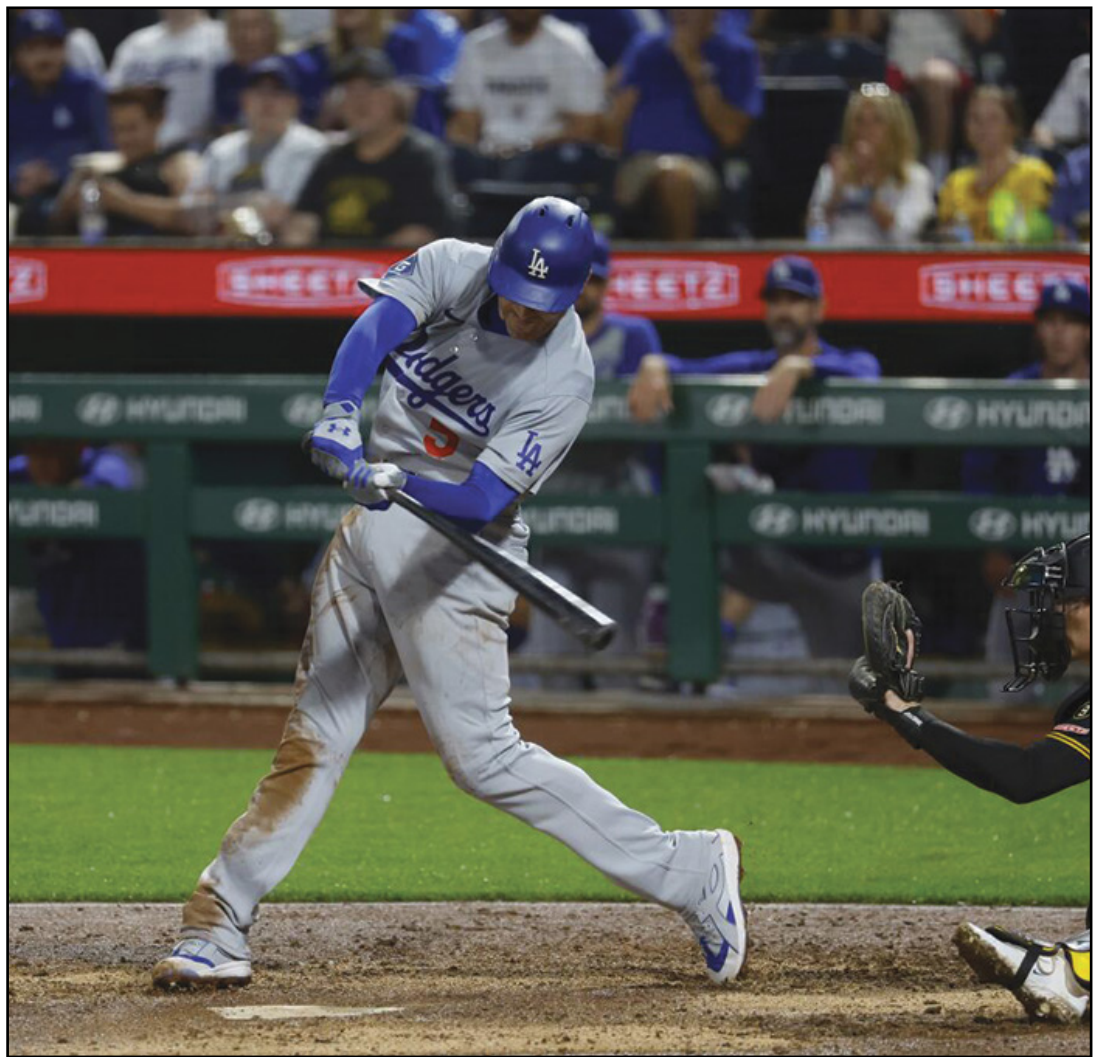
Freddie Freeman gets his 2,500th hit in the seventh inning against the Pittsburgh Pirates on Tuesday.

For physical newspaper subscriptions or to catch up on all breaking headlines, visit us at www.ognsc.com .