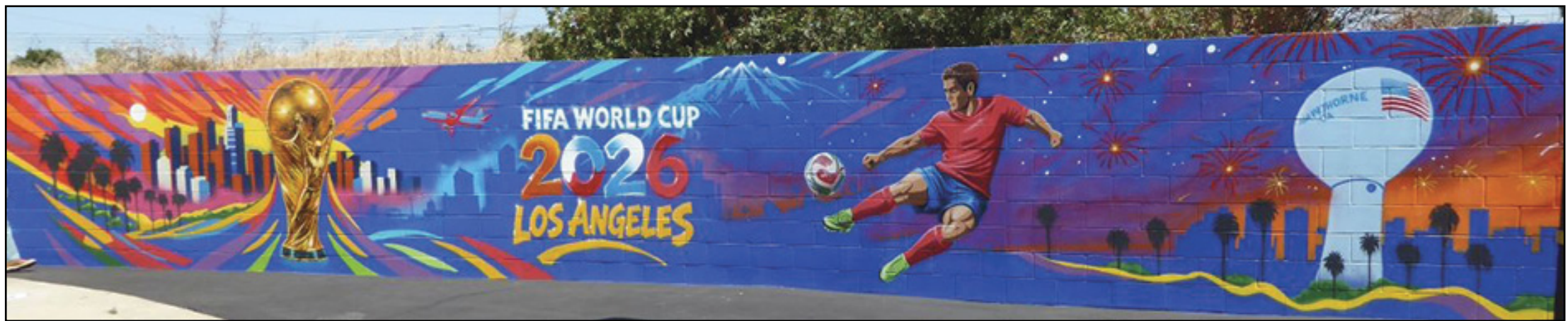
World Cup Mural in Hawthorne