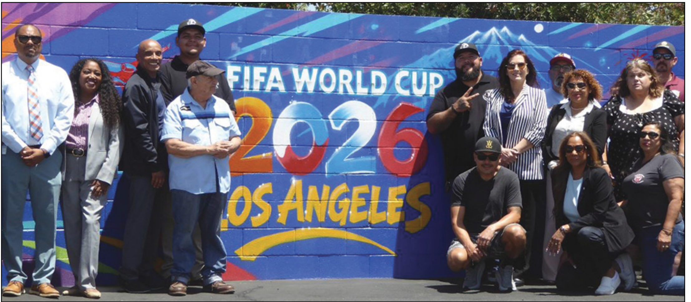
World Cup Mural Unveiling Group Photo