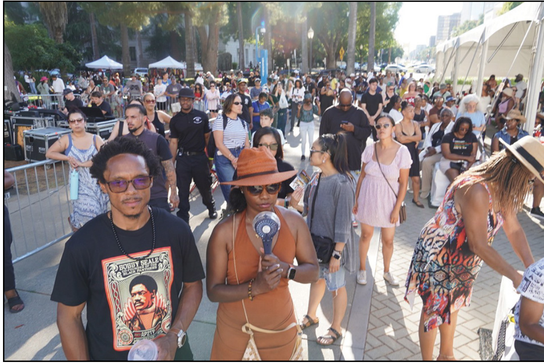
CLBC Concert at the Capitol June 17, 2026.