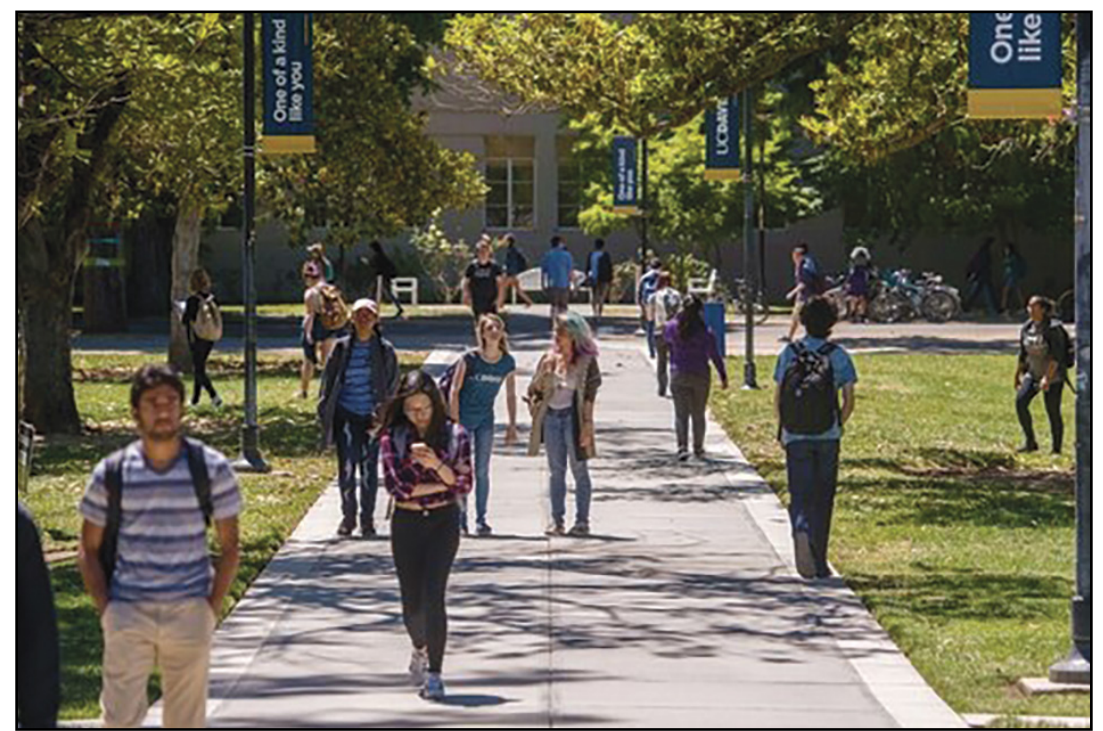
Students walk the campus of the University of California, Davis. A controversial admissions scoring system used by the UC Davis School of Medicine has reignited debate over whether "race-neutral" policies can mask race-conscious decision-making in higher education.

This "mismatch" effect is not speculation. Decades of evidence, including what happened in California after Proposition 209 banned racial preferences, show that Black and Hispanic students often succeeded at higher rates when admitted to schools where their academic preparation matched