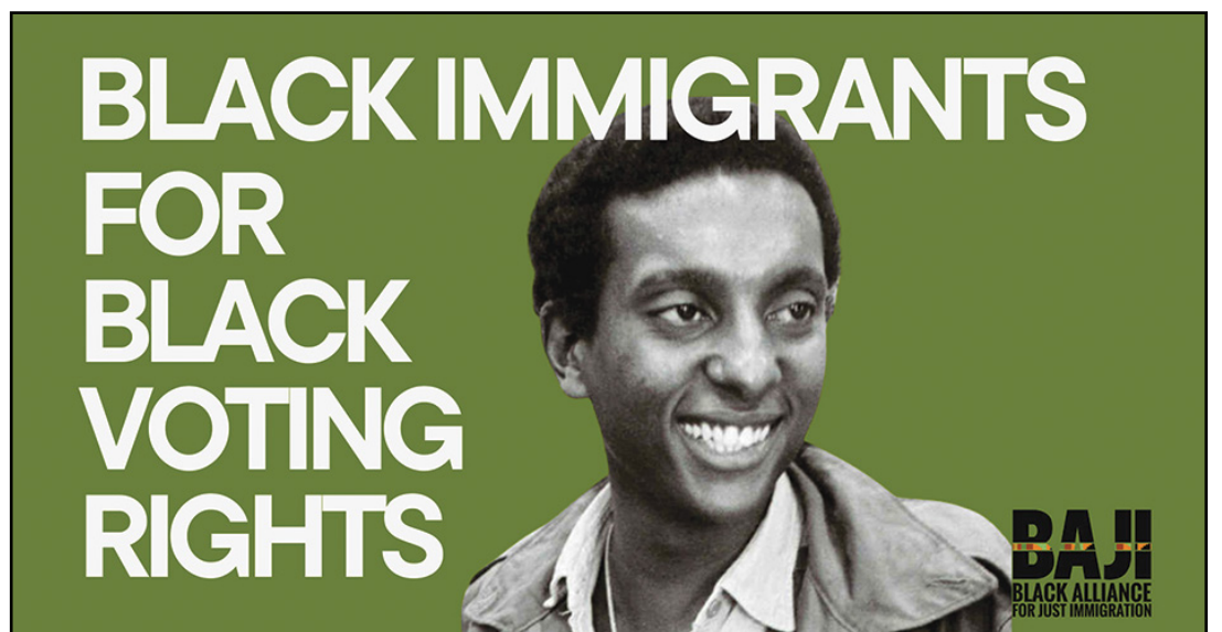
The logo for Black Alliance for Just Immigration uses an image of Kwame Toure (Stokely Carmichael), who fought for Black civil rights in the 1960s.

For more than a decade, the Supreme Court has steadily dismantled the VRA protections.