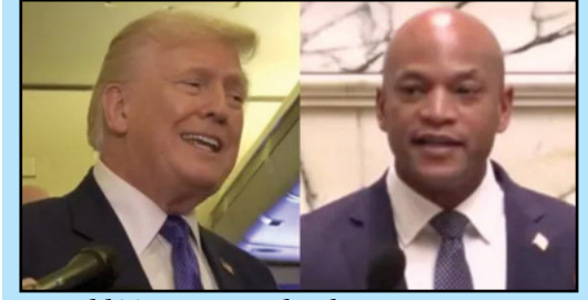
Donald Trump, Maryland Governor Wes Moore