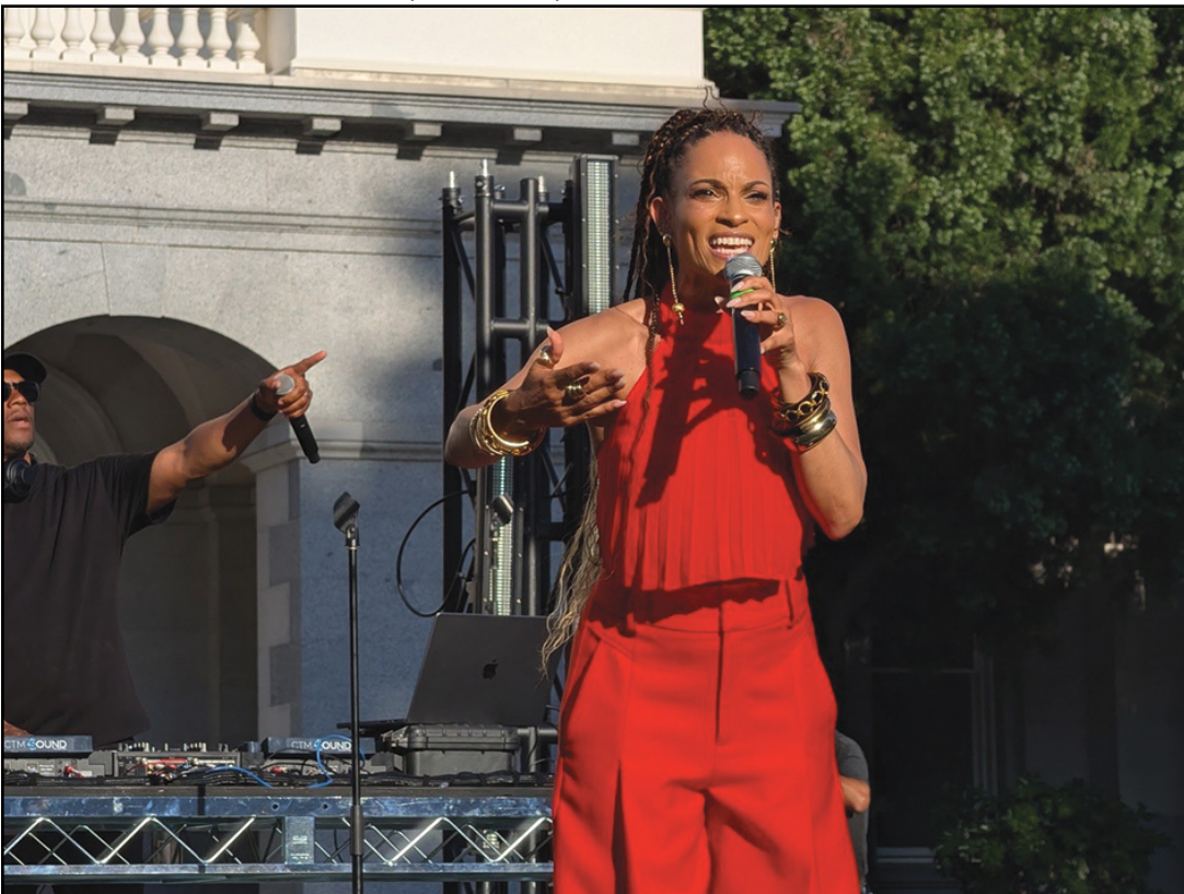
R&B and neo-soul singer Goapele was the featured performer at the California Legislative Black Caucus (CLBC) Juneteenth Freedom Celebration at the State Capitol on June 17, 2026.

"Come after me," said Newsom. "I'm not going anywhere, and the country is watching."