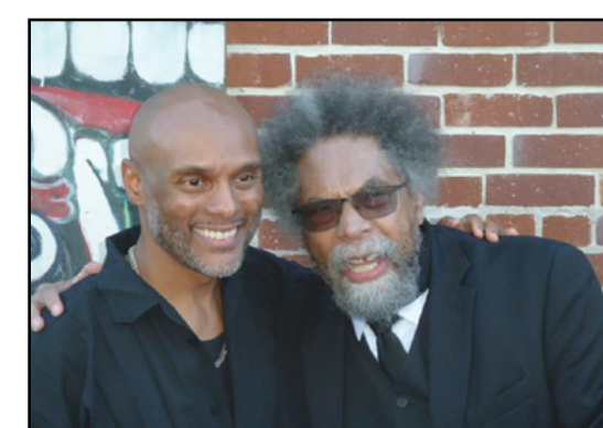
Kenny Lattimore and Dr. Cornel West