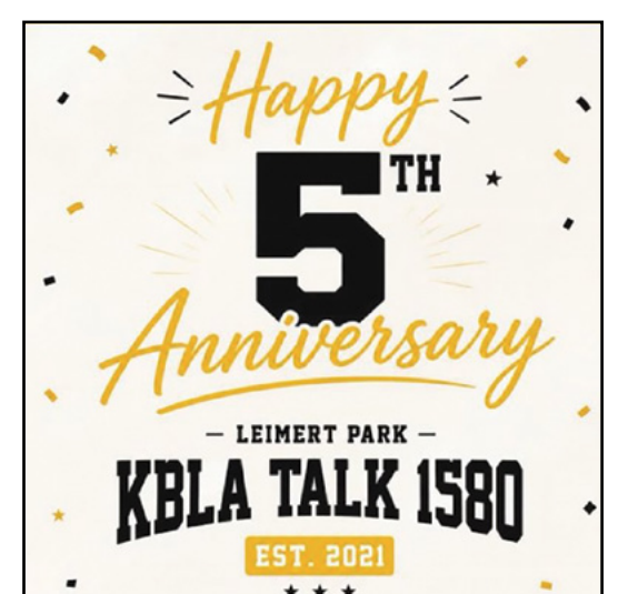
KBLA Talk 5th Anniversary Event Flyer

“Five years ago, on Juneteenth, we launched