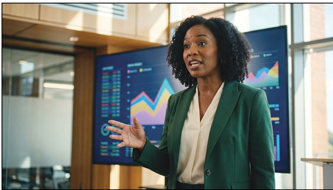
A school administrator leads a data-driven presentation. Advocates say California must dramatically expand its pipeline of Black and diverse school leaders to meet the challenges facing public education in the state.

When he entered LACOE's program, he was already a veteran educator, someone who had served as an interim assistant principal, coached fellow teachers and seen firsthand how school structures shape student outcomes. He knew he wanted to move into administration. "I want to expand my impact and support students at a systems level," he said. "The structures at a school site and family