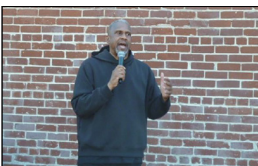
Tavis Smiley