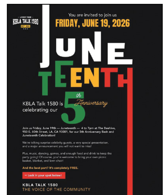
KBLA Talk 5th Anniversary Event Flyer

KBLA Talk 1580 to provide news and information to a part of Los Angeles that has been ignored or pushed to the side for decades,” concluded Tavis Smiley, owner of SmileyAudioMedia, Inc., and host of the nationally syndicated “Tavis Smiley” Talk Show. “We're now syndicated in almost 50 markets across the United States with more growth on the horizon. The best is truly yet to come.”