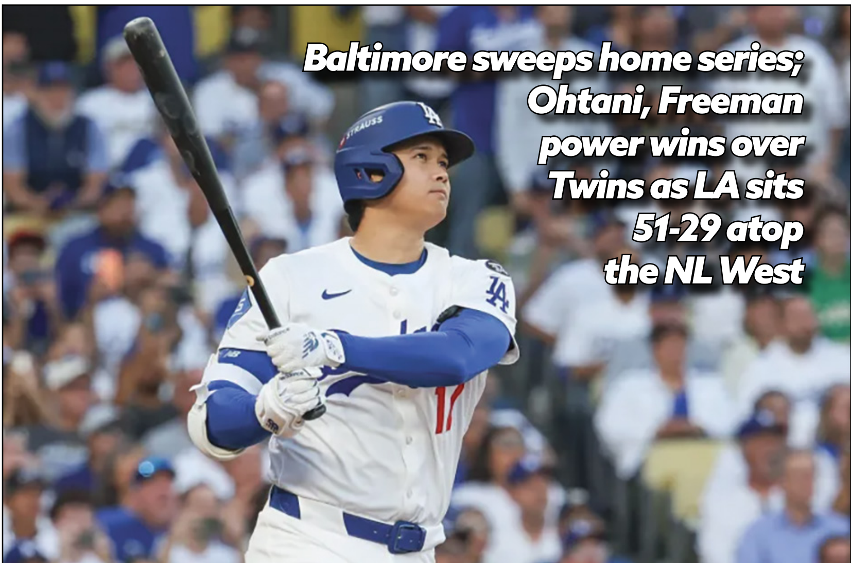
Shohei Ohtani

Baltimore sweeps home series; Ohtani, Freeman power wins over Twins as LA sits 51-29 atop the NL West