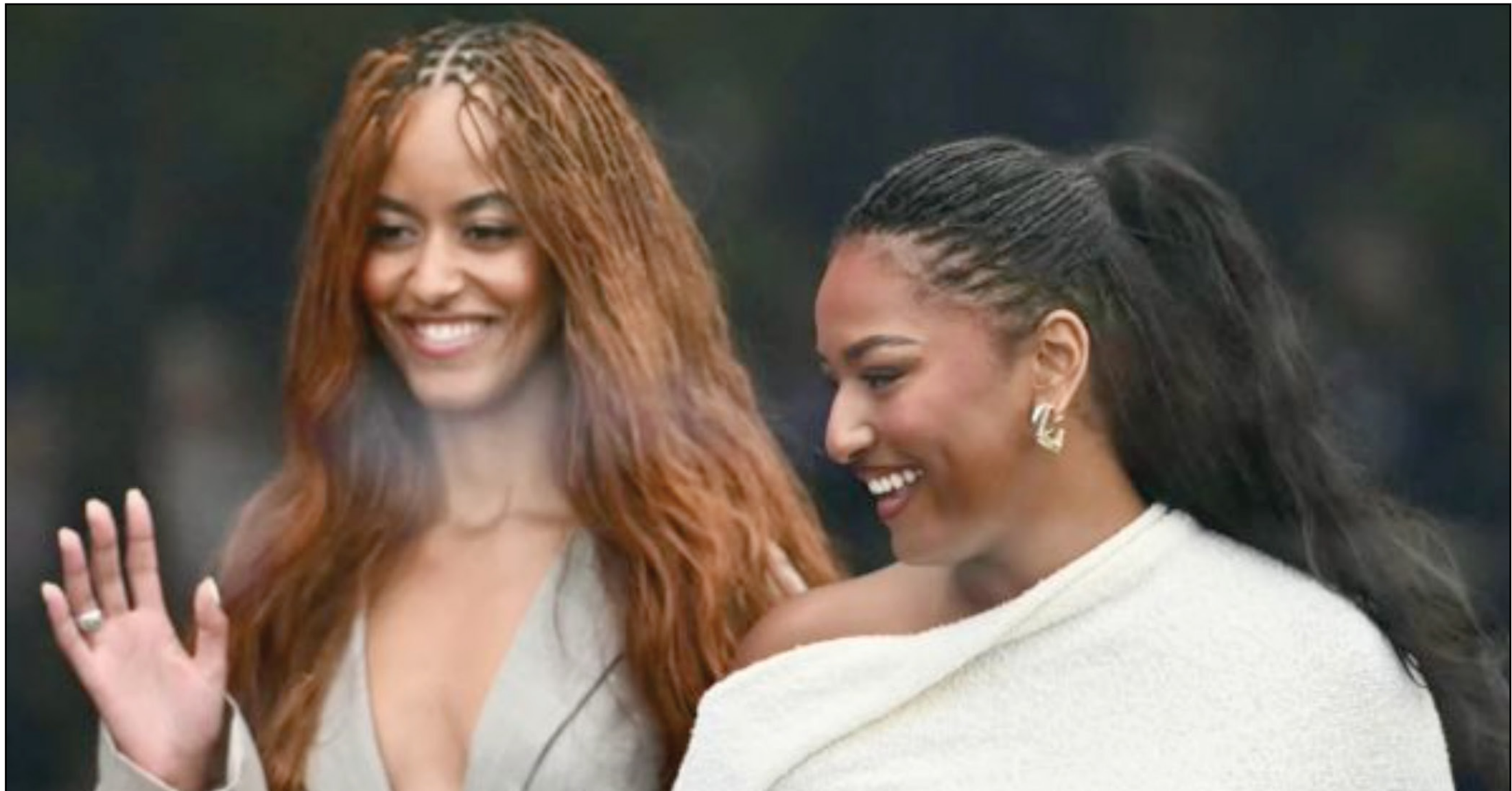
Malia and Sasha Obama in grand opening of Barack Obama's library

Malia and Sasha Obama attended the grand opening of Barack Obama's presidential library in Chicago. They appeared alongside family as the high-profile ceremony drew global attention and major public figures.