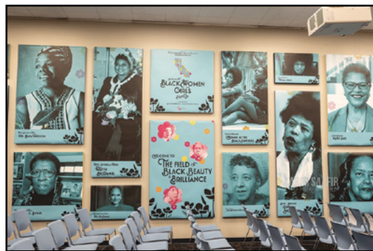
Portraits of celebrated California Black women line the wall of the Museum of Black Women and Girls pop-up, "The Field of Black Beauty and Brilliance," ahead of its June 20, 2026, opening at the A.C. Bilbrew Library Black Resource Center in Los Angeles.