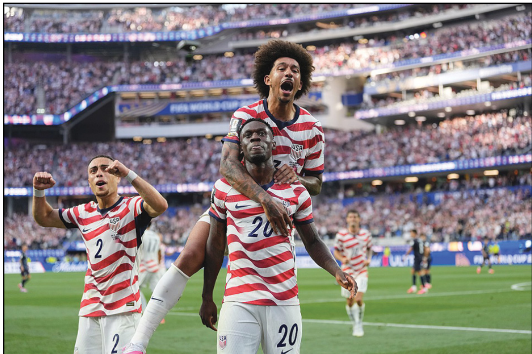
Folarin Balogun celebrates a first-half goal as the U.S. opens the 2026 FIFA World Cup with a record 4-1 win over Paraguay at Los Angeles Stadium.

Seven days later, without their captain, the