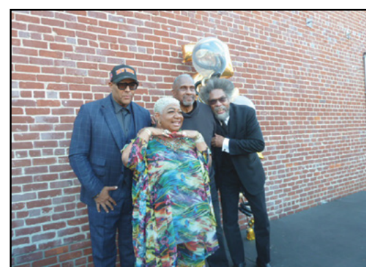
Al B. Sure, Luenell, Tavis Smiley, and Dr. Cornel West